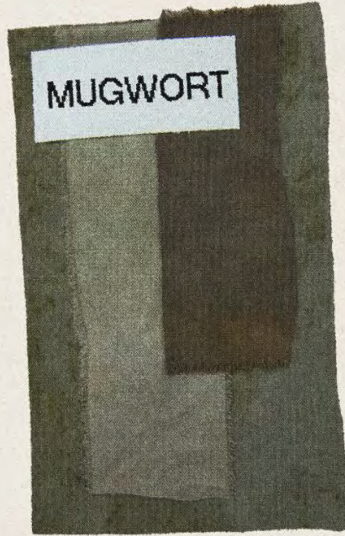
June / Sage Green