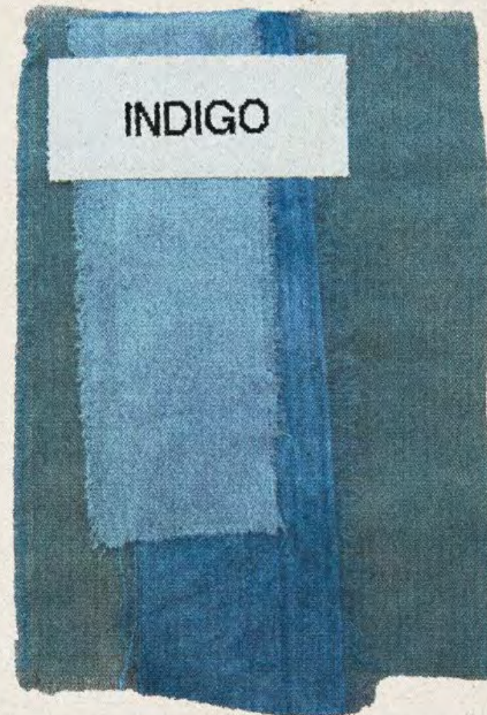
Oct / True Blue