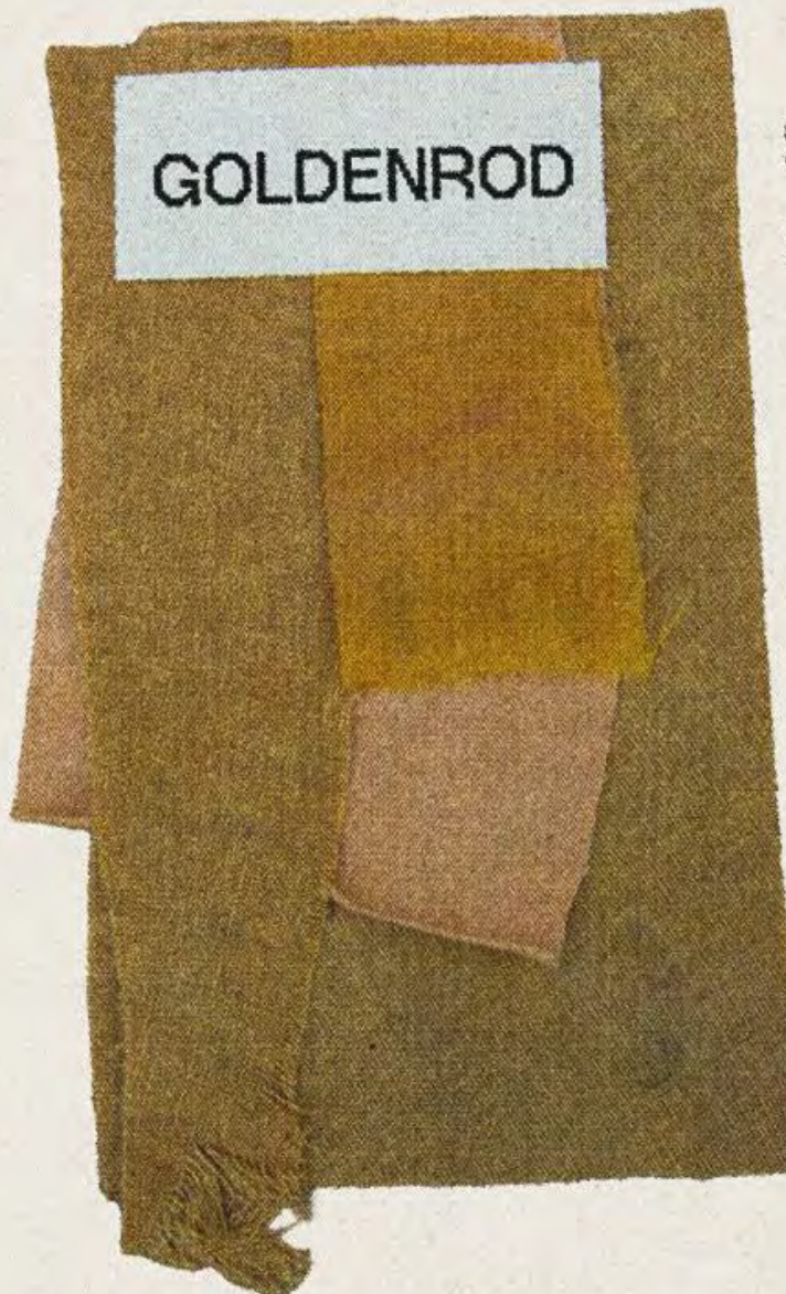
September / Rich Yellow