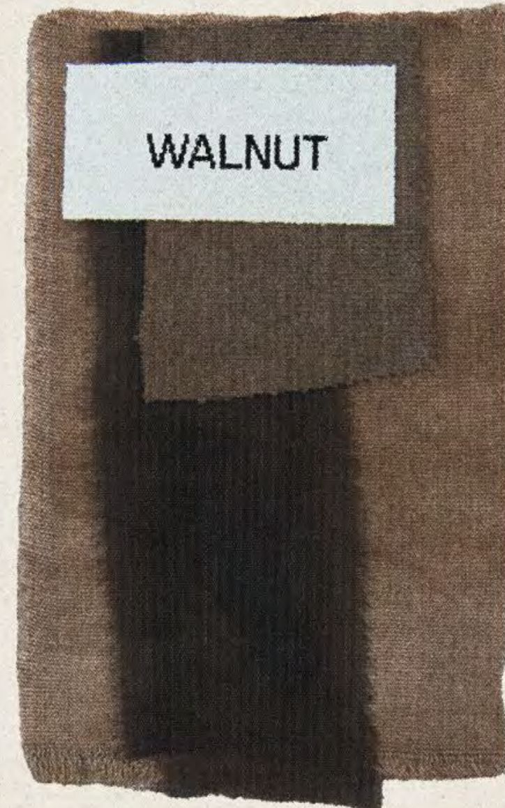
November / Warm Brown