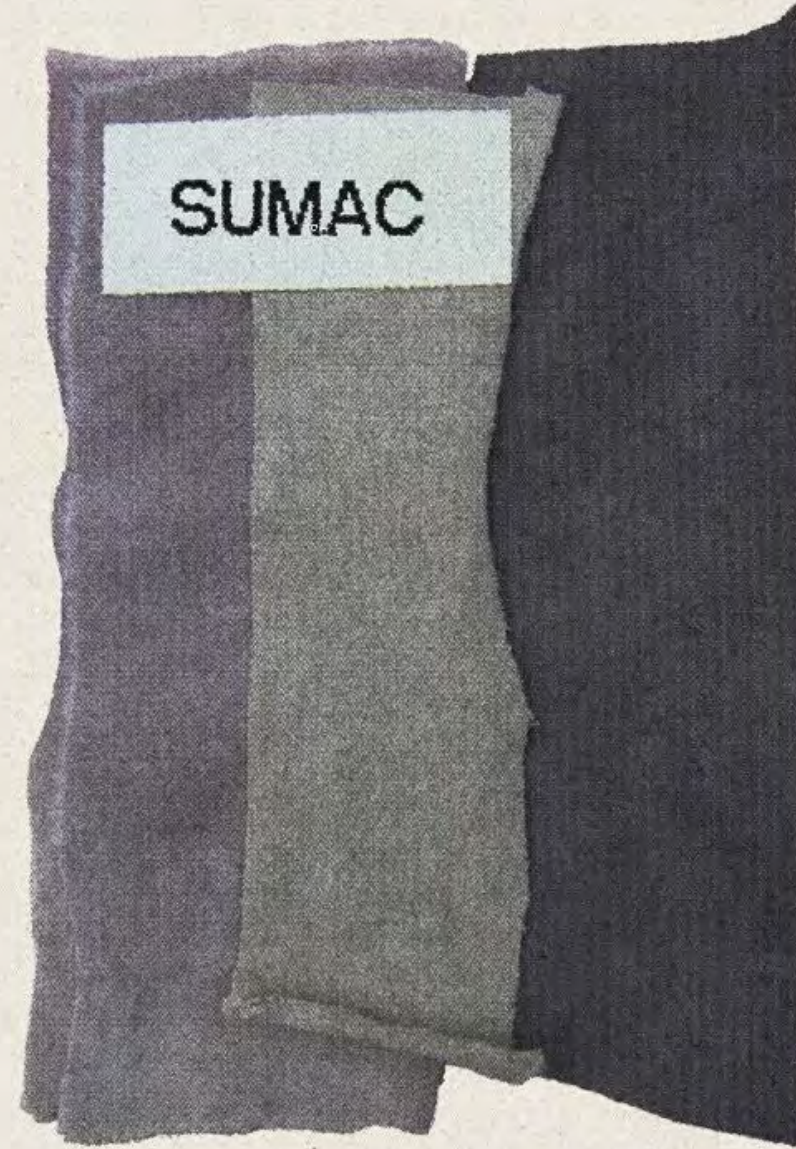
July / Lavender Gray