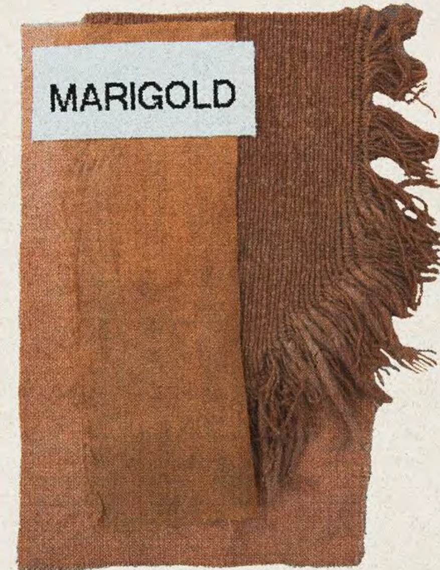
August / Marigold